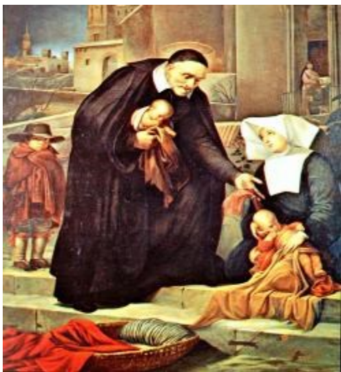
St Vincent de Paul (Celebrated on September 27th)

Website: www.stgeorgeschurch.co.uk Parish Office: parish.office@hotmail.co.uk