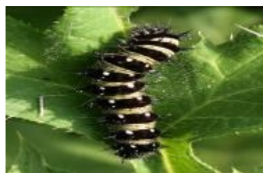
Red Admiral caterpillar, Peacock caterpillar, Large Tortoiseshell caterpillar, Large White caterpillar, Brimstone caterpillar, Painted Lady caterpillar.

A stray thought: How would it be if human beings visibly passed through the "improbable" very different looking stages that butterflies pass through (egg, caterpillar, chrysalis, flying creature)? Or maybe you think they do?