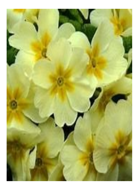
Daffodils, Cowslips, Bluebells, Primroses

Columbine Aquilegia: Spurred flowers, with sepals and petals often different